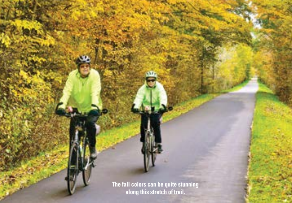
The fall colors can be quite stunning along this stretch of trail.